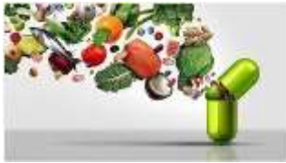
Health & Nutrition Survey